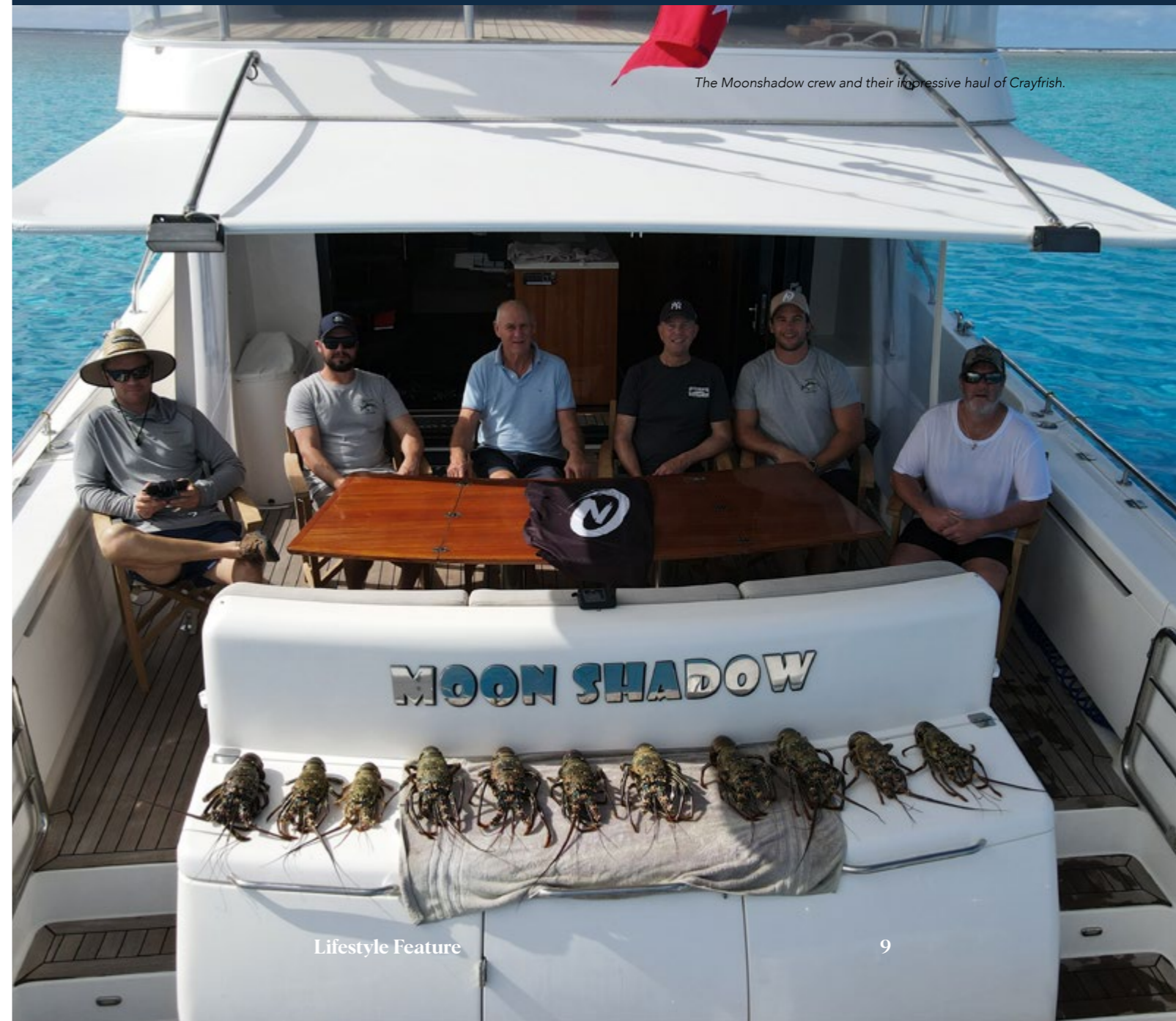
The Moonshadow crew and their impressive haul of Crayfish.