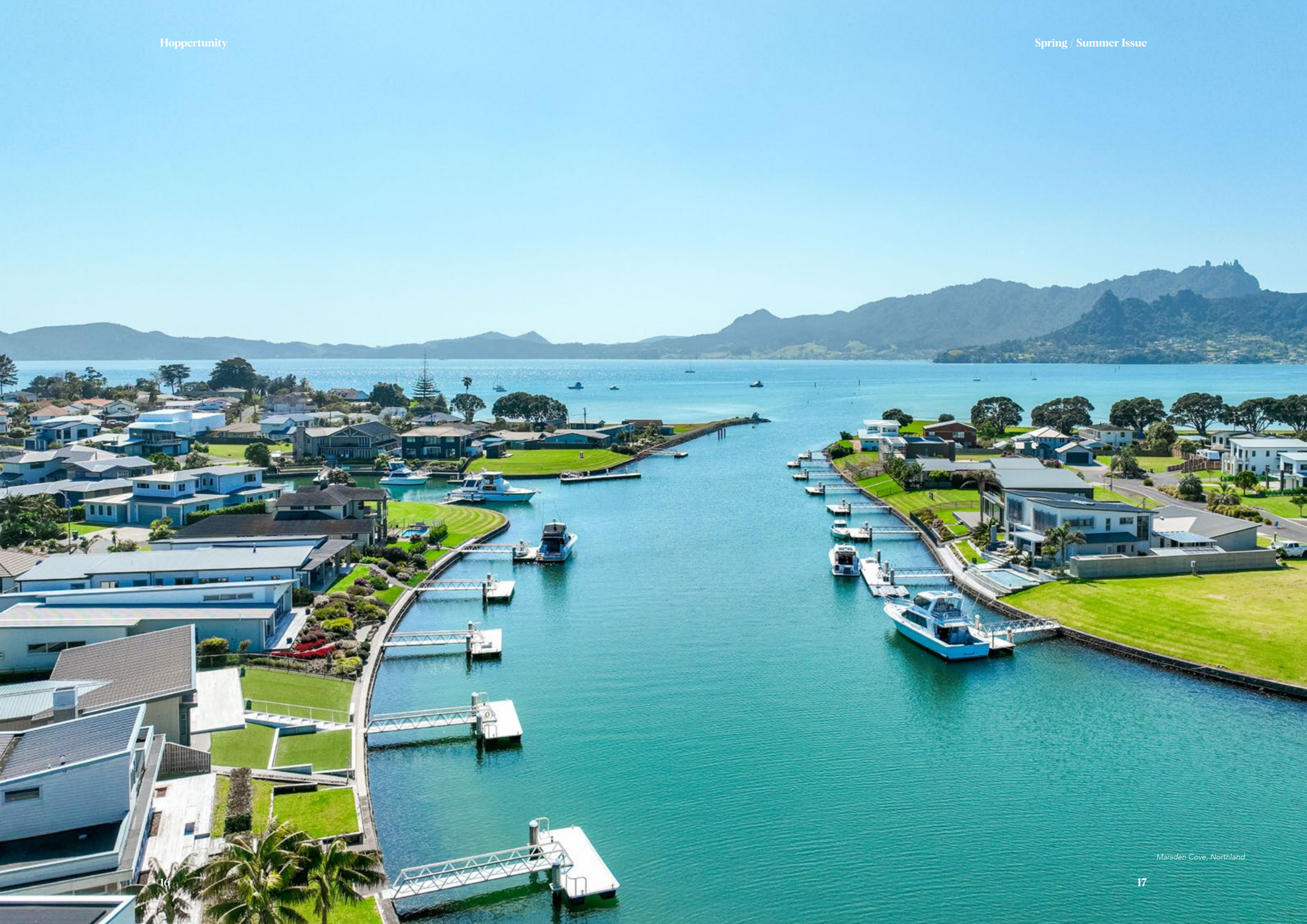
Marsden Cove, Northland