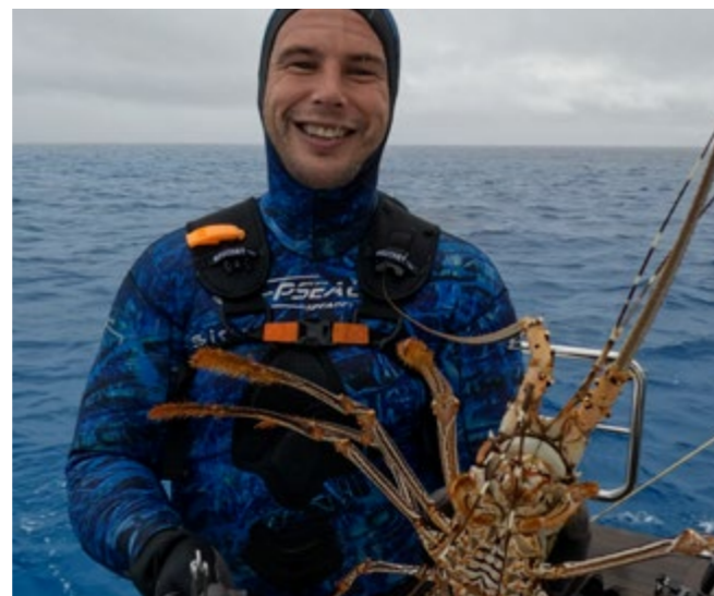
The Moonshadow crew taking in the sunset after a hard days work at sea.

Predominantly cruising around eight or nine knots, the travellers ventured the length of the island chain, accompanied by bright blue skies that sank into crystal clear water, forging friendships with locals of both the aquatic and human varieties.