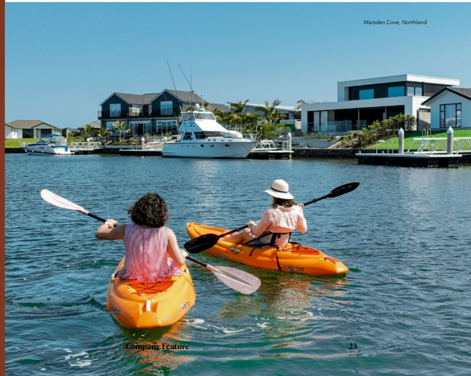
Marsden Cove, Northland

"This could lift sales activity for the remaining weeks until the summer holidays, as Kiwis make moves, eager to get settled into a new home for Christmas."